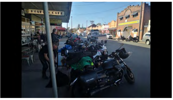
Lunch at "Roadies" on the way up