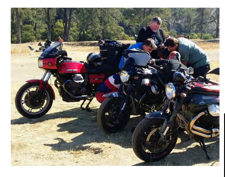
Hang on—shouldn't the knee bone be connected to the thigh bone? 'Talian 'Lectrics were at the rally too.

Thanks to all who attended and a special thankyou as always to Motociclo in St Peters, for their support with raffle prizes.