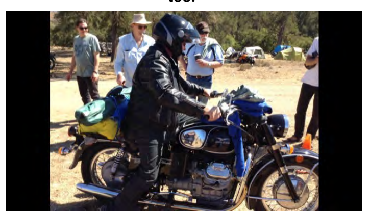
An oldie but a goody