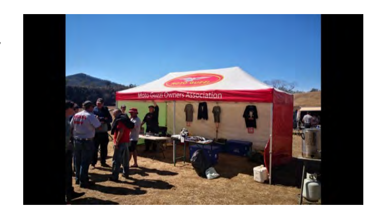
The "Control" tent