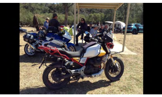
Oh look—a V85TT, McDonalds Version