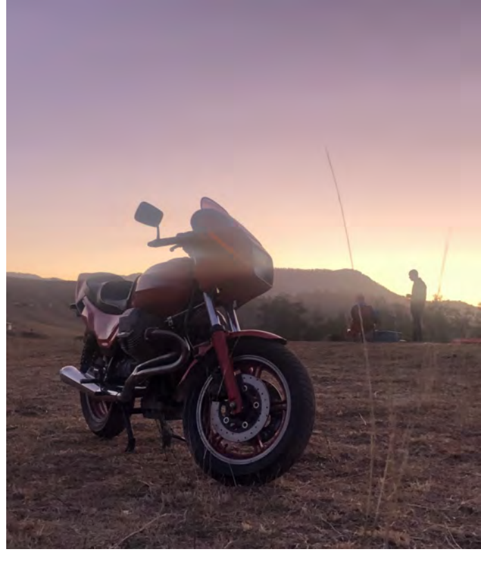
A typical Bretti Sunrise